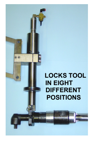
FOR RT. ANGLE TOOLS ADD SUFFIX -CL TO MODEL NUMBER