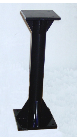
OPTIONAL FLOOR STAND 42" HIGH MODEL FS-VTSK-72